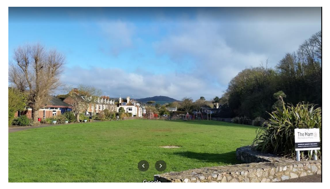
Ham (East) Short Stay Car Park from Esplanade side: