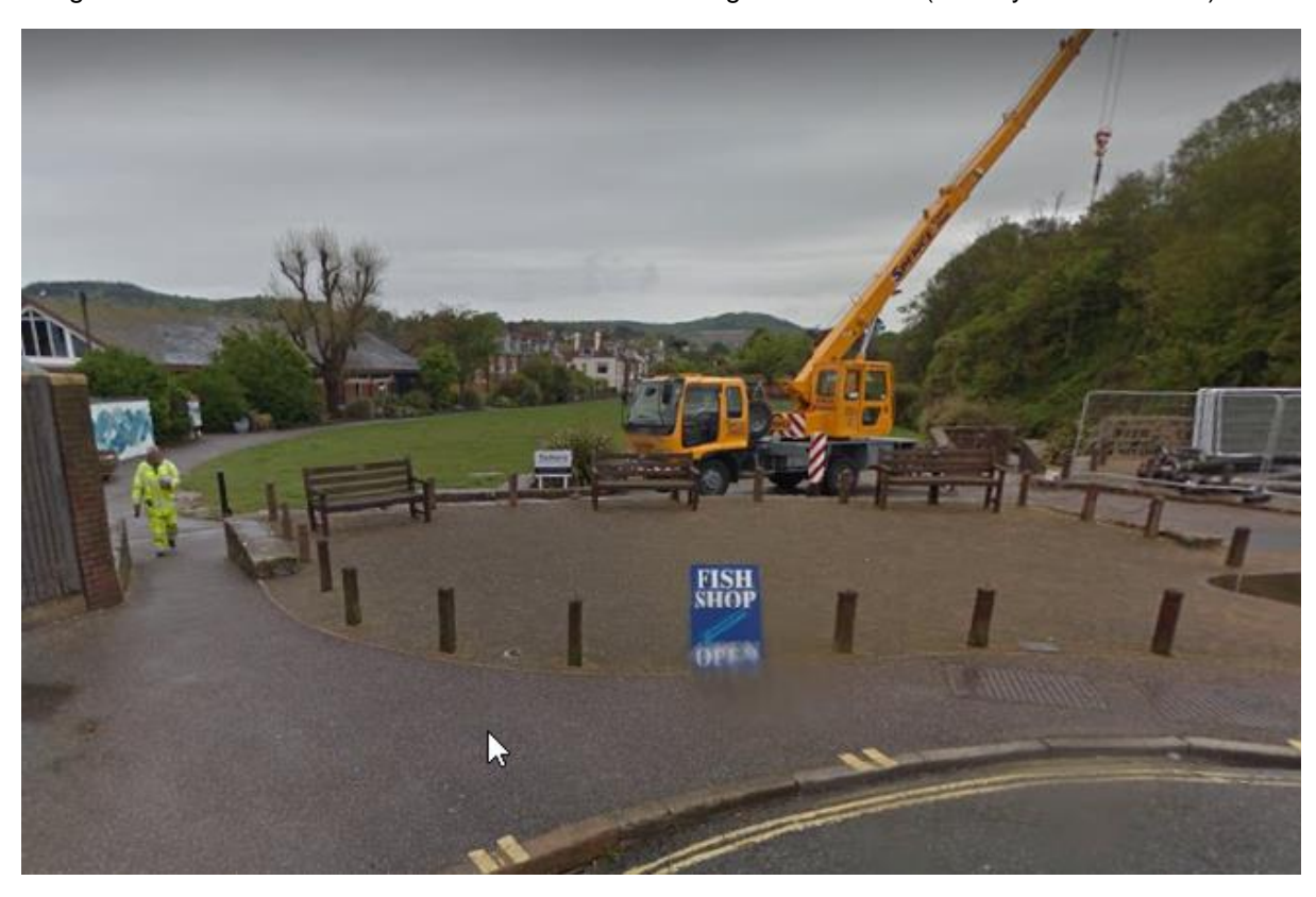
Image of "The Ham Recreation Ground" taken from Google Street View (so may not be current):